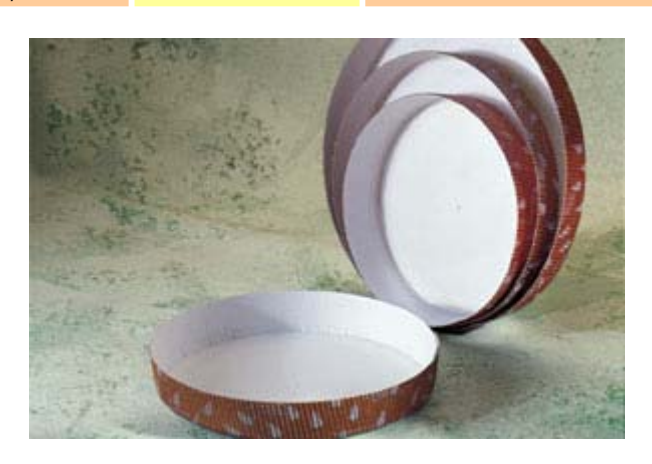
Thanks to the special non-stick paper and tear-strip, the product can be easily extracted while the wrapped presentation is elegant and appealing.